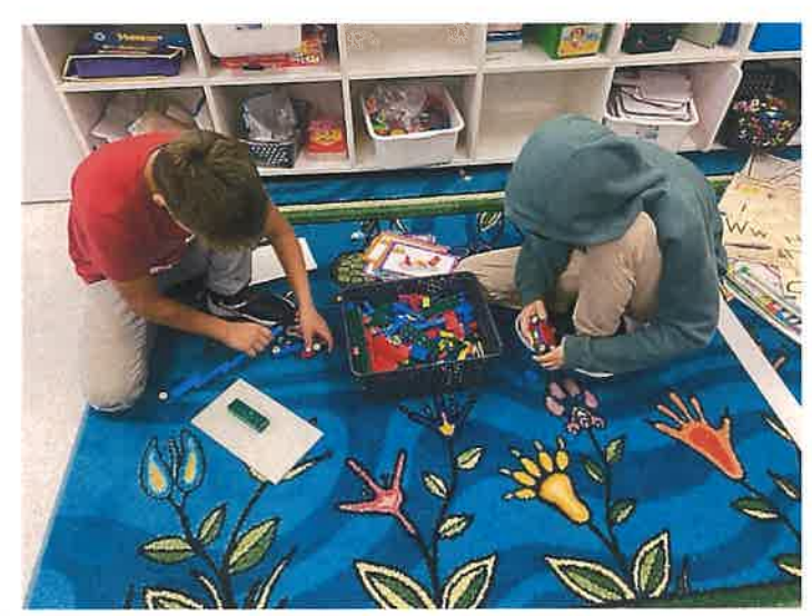
ADST/Steam Wonderful Wednesday