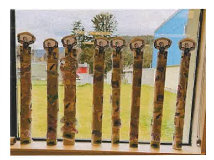
Yoga buddies Kindergarten to grade 5,