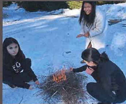
Curiosity and wonder