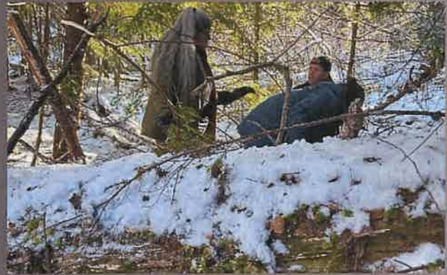
On the land